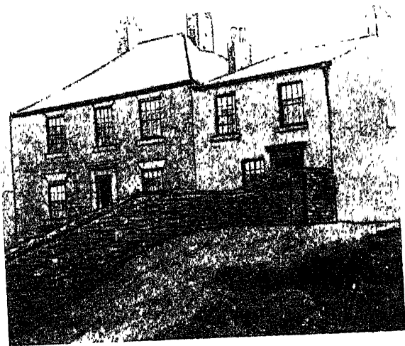
THE HOUSE (to the left) AT HOWDEN-ON-TYNE WHERE W. T. STEAD SPENT HIS BOYHOOD