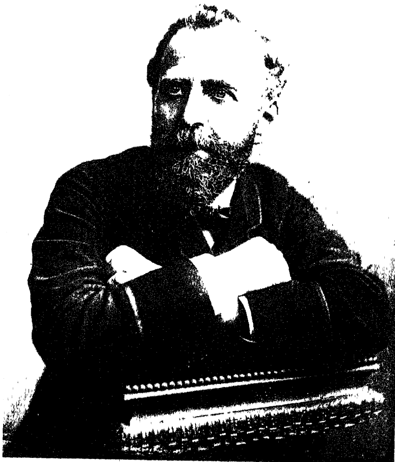
W. T. STEAD IN 1839