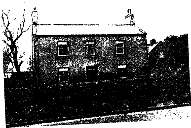
THE MANSE AT EMBLETON WHERE W. T. STEAD WAS BORN